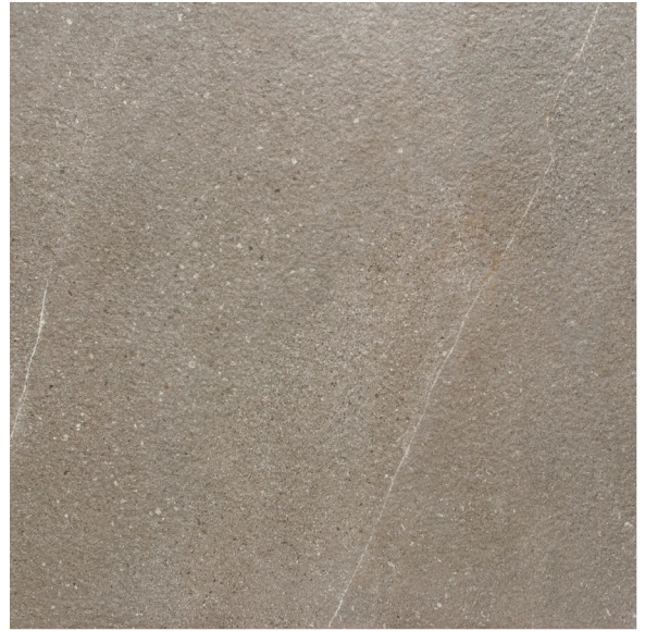
Structured Finish 60 x 60 cm (24" x 24") HV.RS.MKA.2424.ST