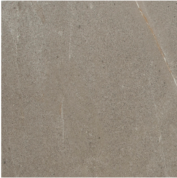
Matte Finish Nominal Thickness: 9 mm 60 x 60 cm (24" x 24") HV.RS.MKA.2424.MT