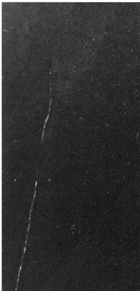
◀ Matte Finish Nominal Thickness: 9 mm 30 x 60 cm (12" x 24") HV.RS.BLK.1224.MT 60 x 60 cm (24" x 24") HV.RS.BLK.2424.MT 60 x 120 cm (24" x 48") HV.RS.BLK.2448.MT